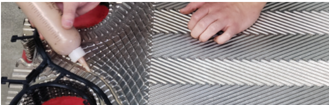
PLATE AND/OR GASKET DIRECT REPLACEMENT AND INSTALLATION FOR ARMSTRONG, ALFA LAVAL, VICARB, TRANTER, LEITCH, BELL & GOSSETT, APV & MORE