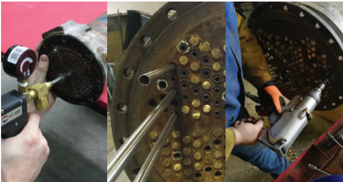
TUBE VACUUM TESTING, CLEANING, REPLACEMENT, TUBE PLUGGING, SLEEVING AND EXPANDING