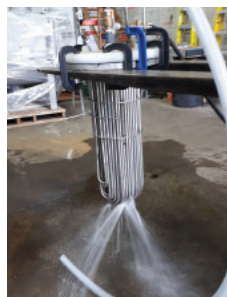
SHELL & TUBE PRESSURE TESTING