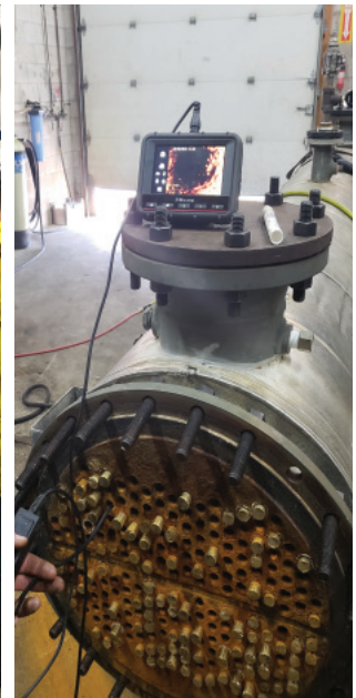
BORESCOPE IMAGING FOR LOCATING CRACKS, BLOCKAGES, PUNCTURES ETC.