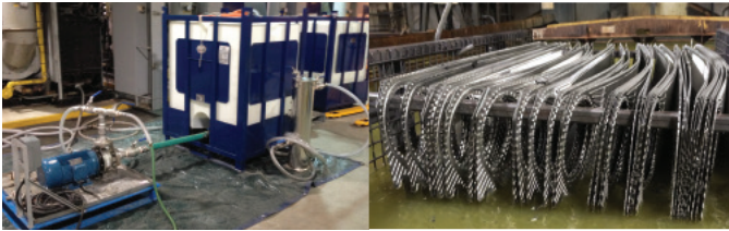
ONSITE CHEMICAL FLUSHING, HIGH PRESSURE CLEANING & OFFSITE CHEMICAL DIPPING