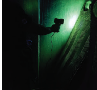
BLACK LIGHT & DYE PENETRANT TESTING