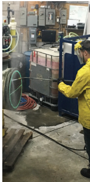
PRESSURE WASHING, CHEMICAL CLEANING